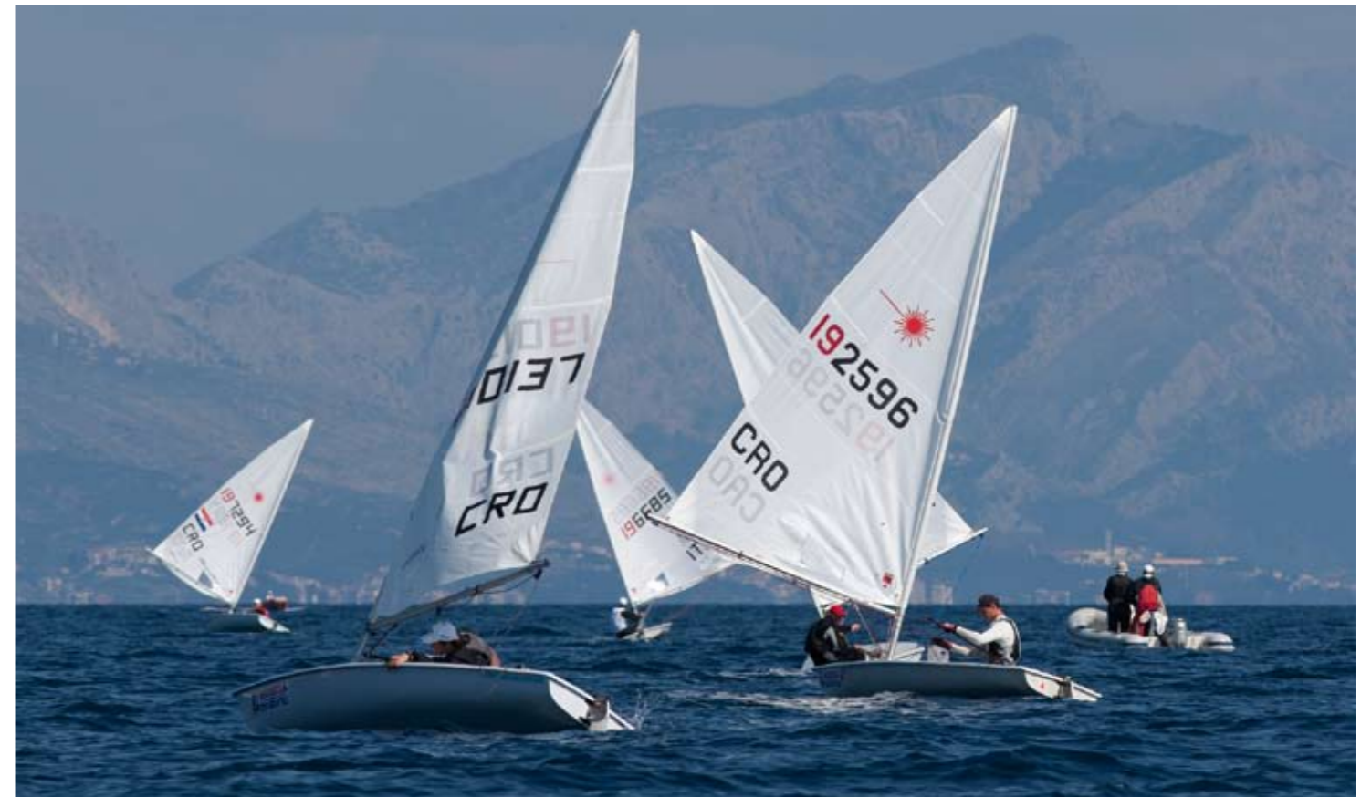
10TH EDITION SPLIT OLYMPIC SAILING WEEK – SEVENTY SAILORS FROM 12 COUNTRIES SAIL